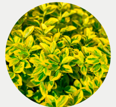
Euonymus Emerald and Gold

*Panola colours may vary from the original design specification and will depend on plant availability at the time of ordering Matching troughs are also available in all our colour options.