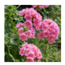
Geranium Zonal 'Karen Light Pink'