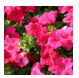
Surfina Hot Pink