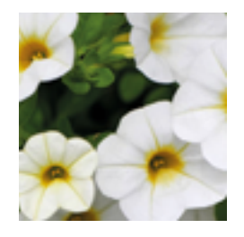
Petunia Surfina White