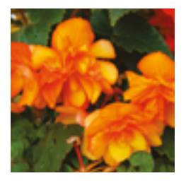
Begonia Illumination Mixed